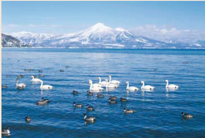
Sakkahama beach on the western shore of Lake Inawashiro is a great summer spot for watersports and camping.