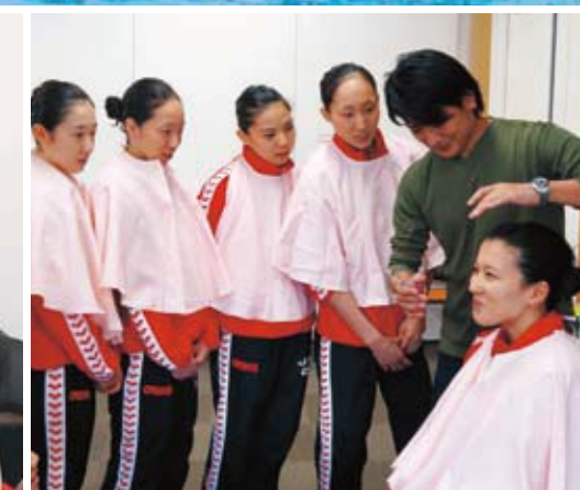
Each time the choreographed program changes, makeup lessons begin. Mermaids Japan members get their own rigorous instructions.