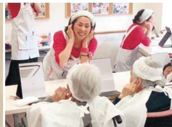
A scene at a personal beauty class for the elderly. Putting on makeup is about more than good looks. It can also increase mental alertness, physical fitness and everyday life skills.