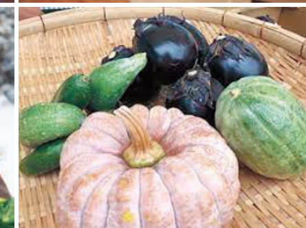
Top left: Kozuyu soup packed with vegetables such as taro root and carrots is often served at celebratory occasions. Top right: Wappameshi rice with vegetables is steamed in rounded containers made from cedar or cypress. Left: Yukishita cabbage, which is actually grown under the snow, is a local specialty known for its fruity sweetness. Above: Aizu kogiku kabocha (pumpkin-like squash) and Aizu maru nasu (round eggplant)—two traditional vegetables grown in Aizuwakamatsu.

Mt. Bandai to the northeast ranks among the “100 Famous Japanese Mountains.” With an elevation of 1,819 meters, it is a popular destination for mountain climbing in the summer and skiing in the winter. The mountain is also home to a lush array of alpine plants like Japanese azalea and to rare insects like the Bandai stag beetle.