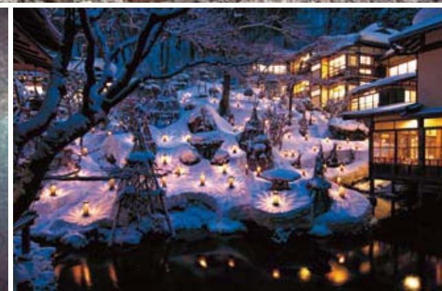
Above: Tsuruga Castle, the seat of the Aizu clan's feudal lord. Spring cherry blossoms in full bloom. Left: A prosperous samurai warriors castle town at one time, Aizuwakamatsu is still home to buildings that evoke the Edo period. Middle: Beautifully glossy Aizu lacquerware boasts a 400-year history. Right: Soak up the heat in outdoor hot spring baths surrounded by snowscapes, a special winter experience at Higashiyama Onsen.