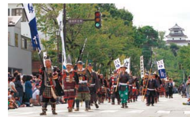
Held each year in September, the Aizu Autumn Festival features groups dressed as samurai in period costume.

Aizuwakamatsu offers beautiful mountains, luxurious hot springs, lush nature, as well as food and crafts born of the samurai culture. The colorfully majestic scenes that unfold here are truly unforgettable.