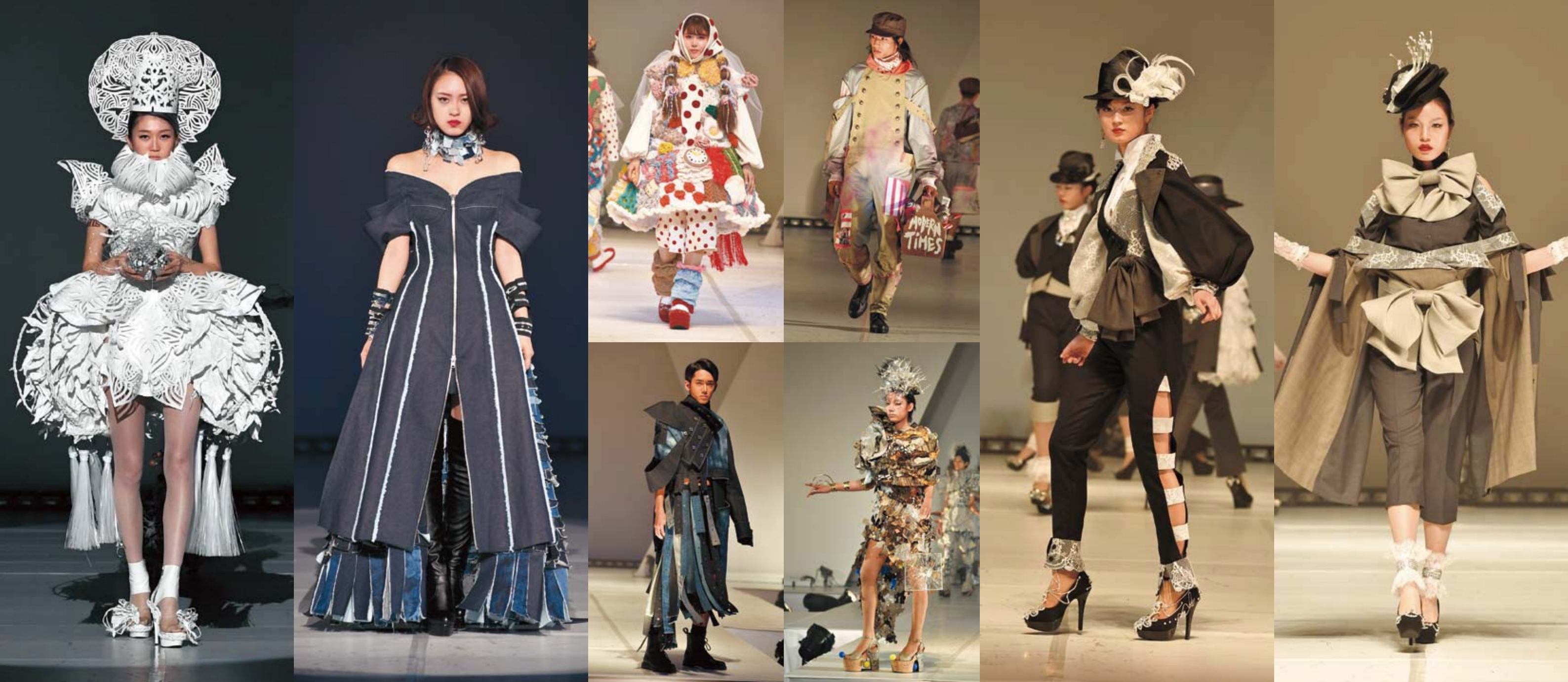
Scenes from the 2017 fashion show at Bunka Fashion College in Tokyo. Globally active designers like Kenzo and Yoji Yamamoto graduated from the college.