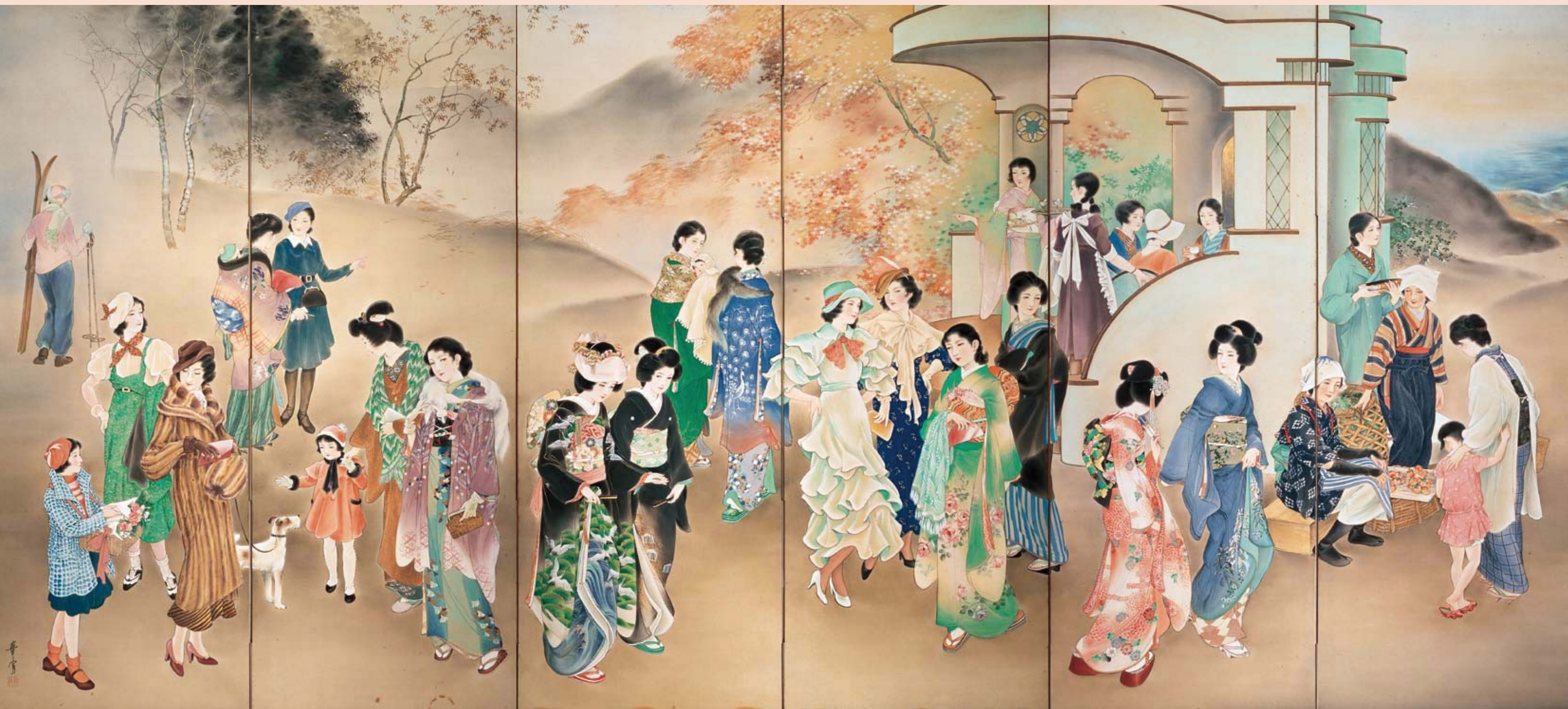
Takabatake Kasho's Utsuri-yuku Sugata ("Changes in Fashion"), 1935. (Illustration courtesy of The Yayoi Museum). This screen shows women in four seasons from the late 19th century to the early 20th century. Here we see women's fall and winter apparel.