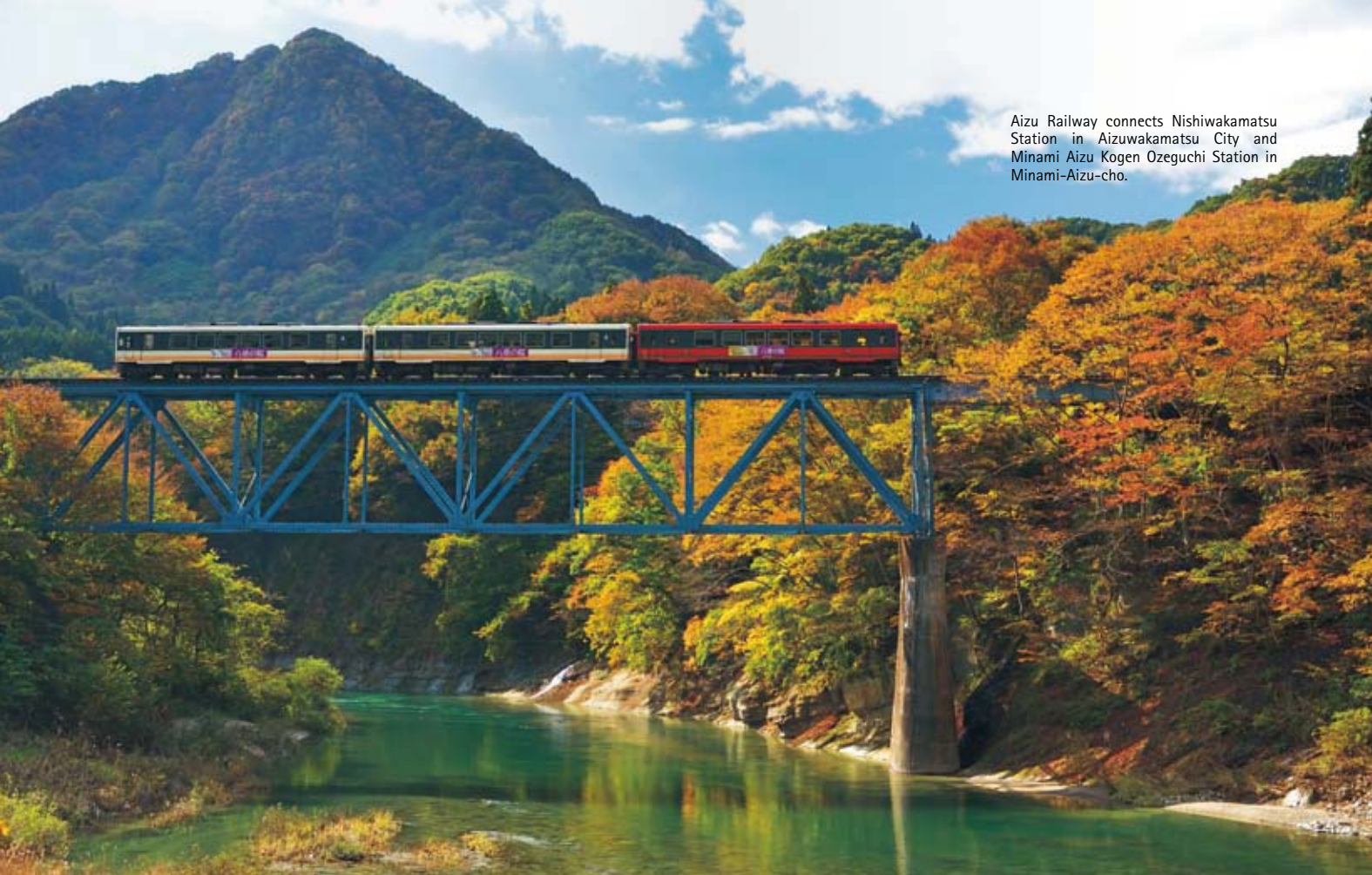
Aizu Railway connects Nishiwakamatsu Station in Aizuwakamatsu City and Minami Aizu Kogen Ozeguchi Station in Minami-Aizu-cho.