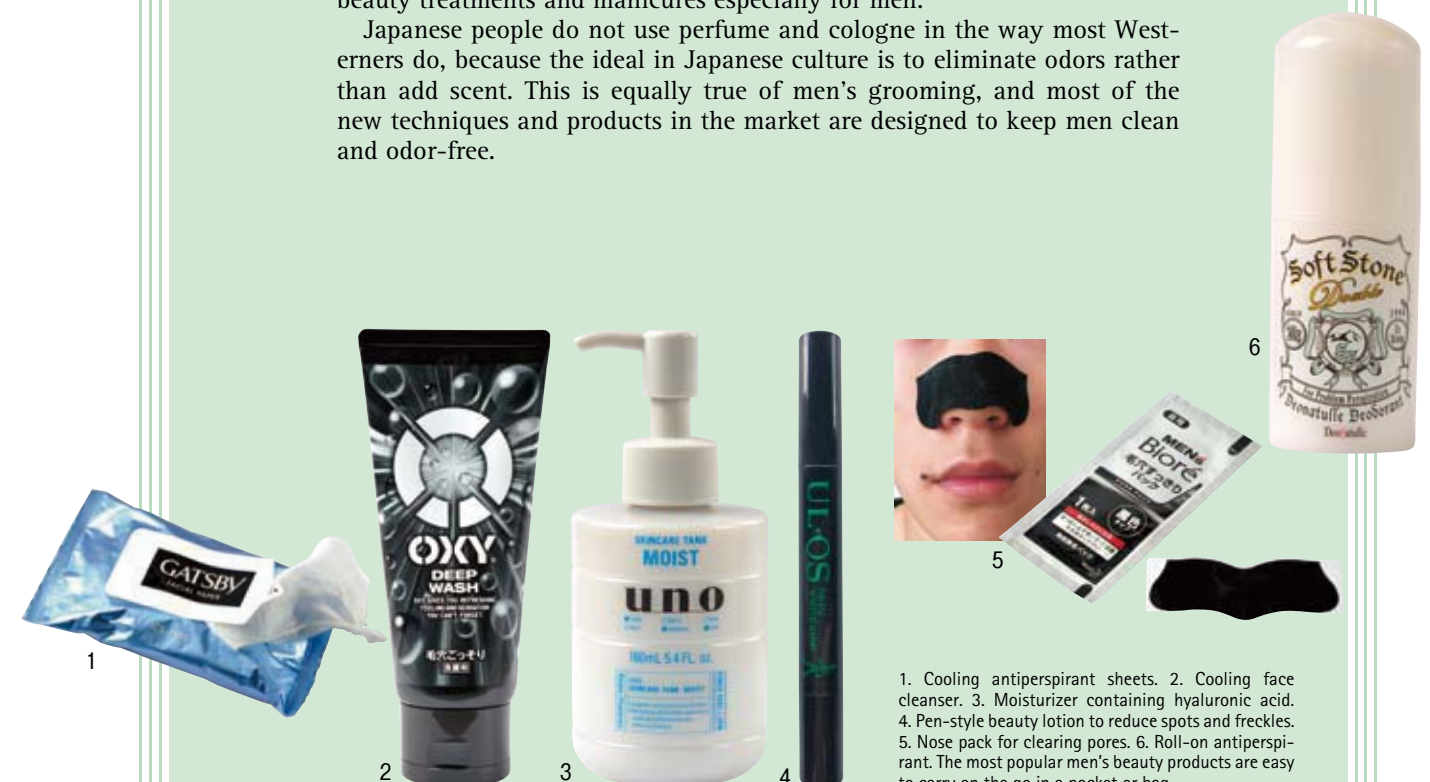
1. Cooling antiperspirant sheets. 2. Cooling face cleanser. 3. Moisturizer containing hyaluronic acid. 4. Pen-style beauty lotion to reduce spots and freckles. 5. Nose pack for clearing pores. 6. Roll-on antiperspirant. The most popular men's beauty products are easy to carry on the go in a pocket or bag.

Japanese people do not use perfume and cologne in the way most Westerners do, because the ideal in Japanese culture is to eliminate odors rather than add scent. This is equally true of men’s grooming, and most of the new techniques and products in the market are designed to keep men clean and odor-free.