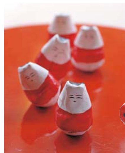
Left: The round-bottomed okiagari-koboshi doll may wobble, but it won't fall over. Below: Akabeko bobble head doll. The name is derived from “ aka ,” which means red, and “ beko ,” which means cow in the local dialect. Right: Known for its famous striped pattern, Aizu cotton is extremely durable.